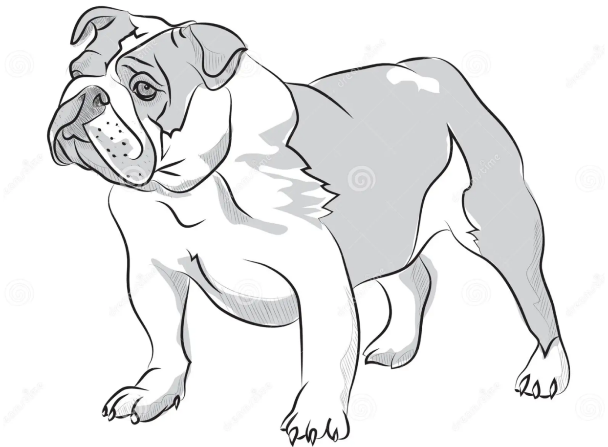
Standing TT Bulldog 17"H x 27"L x 13"D (textured)